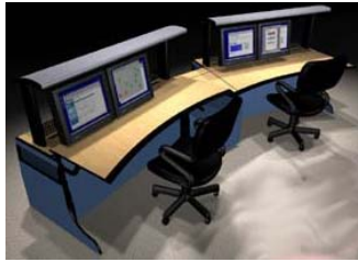
Flat Panel Command Center www.DatacomHQ.com

Switching and monitoring applications are varied and specific. Secure console servers for access and management of server environments, KVM to control multiple computers from one or more monitors and video splitters all may be desirable in your environment.